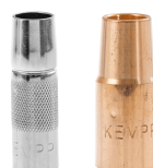
MIG/MAG gas nozzles

Gun neck carries the electrical current to the tip of the gun along with the shielding gas and cooling liquid. You can extend your welding gun lifetime by updating the neck.