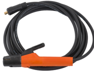
Welding cable 5 m 16 mm 2