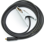
Earth return cable 5 m, 16 mm 2