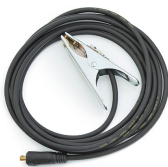
Earth return cable 25 mm 2 , 10 m