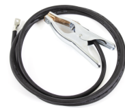
Earth return cable 25 mm 2 , 5 m