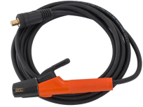
Welding cable 5 m 25 mm 2