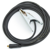
Earth return cable 5 m, 16 mm 2