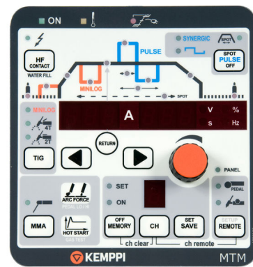
Control panel MTM

MTX panel is meant for piping etc. TIG / MMA applications. Features of this panel include torch switch latching 2T/4T, Pulse, synergic rapid pulse and spot TIG, HF contact, ignition control, remote control and setup function control option.