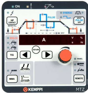
Control panel MTZ

MTZ panel is meant for piping etc. TIG / MMA applications. Features of this panel include torch switch latching 2T/4T, Pulse, synergic rapid pulse and spot TIG, HF contact, ignition control, remote control and setup function control option, welding current upslope and MINILOG.